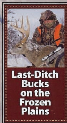
Last-Ditch Bucks on the Frozen Plains

NRA Official Journal of the National Rifle Association